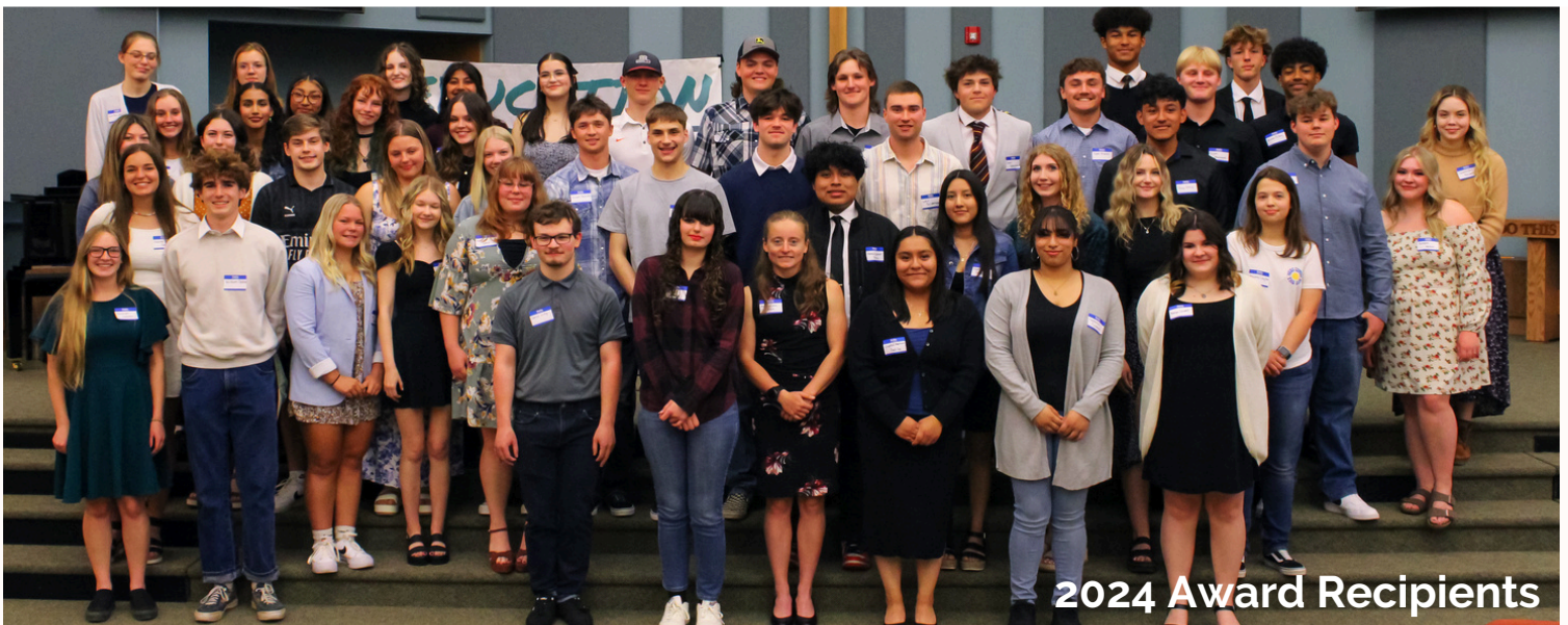
2024 Award Recipients